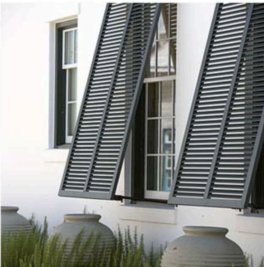
Charles Walton IV / Styling: Leigh Anne MontgomeryTodd Childs

Pairs of stylized structures reminiscent of dovecotes flank the road at either end of the stretch of Scenic Highway 30A that passes Alys Beach.