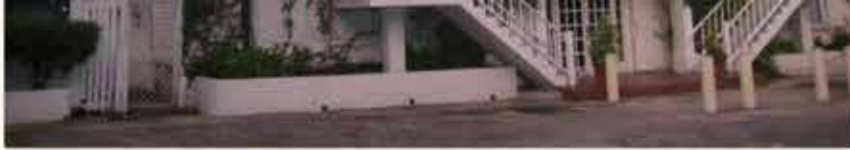
or the High Court Building.